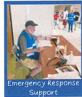
Emergency Response Support